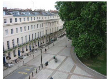
View of Fitzroy Square

Water: Mains. Electricity: Mains. Drainage: Mains. Gas: Mains. It is the responsibility of the purchaser to ensure that services are available and adequate for the future use or development of the property.